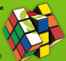
Image lists that are comfortable to use. Automatic thumbnail creation. One click uploading. After using our Picture Upload Web Part, you will never look at image management in SharePoint the same again. And your users will love you for the extra images you put on the webpage.